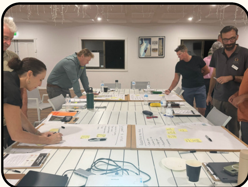
The Scotts Head Master Plan Project Reference Group members discuss the main themes around managing Scotts Head's foreshores and public open space at the group's inaugural meeting on Thursday 26 March.