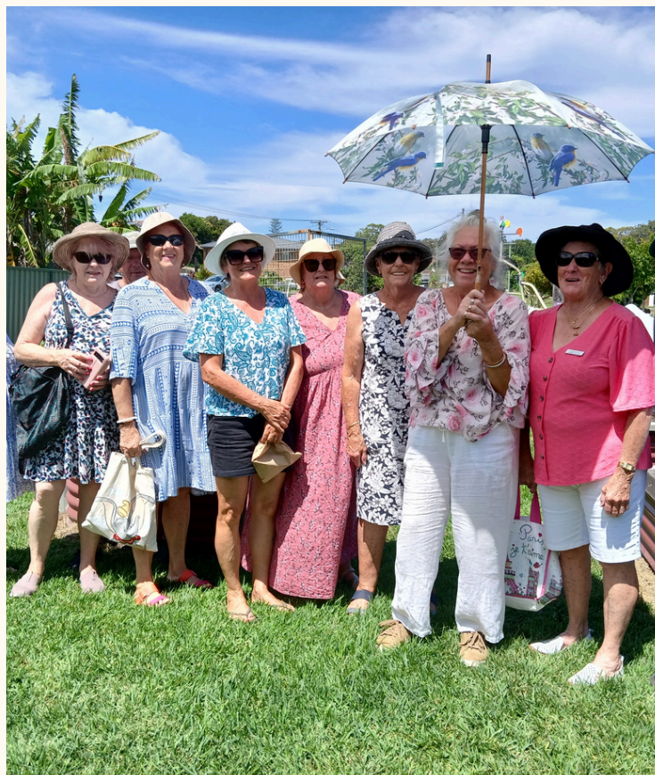
Stuart's Point Garden Club visit